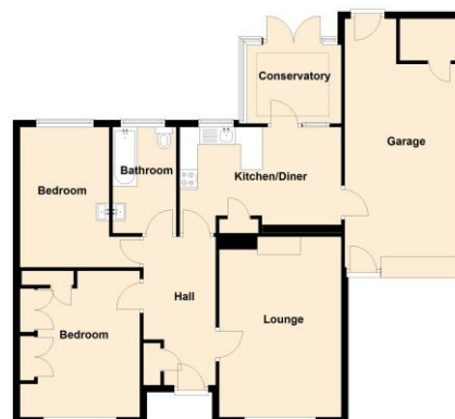
Ground Floor Approx. 103.4 sq. metres (1113.2 sq. feet) Total area: approx. 103.4 sq. metres (1113.2 sq. feet)